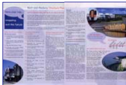
Above: Two-page spread in 'Around Kent'

On the whole, it was felt that the press campaign was reasonably successful, although the publication of feature articles that was hoped for (stimulated by the media briefing notes) did not materialise.